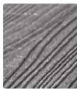
Cape Town Gray (011)