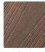
Smoked Bark (Q1R)