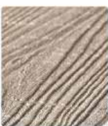
Antique Wash (089)