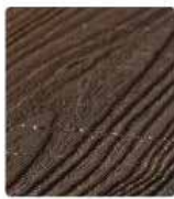
Espresso Roast (015)