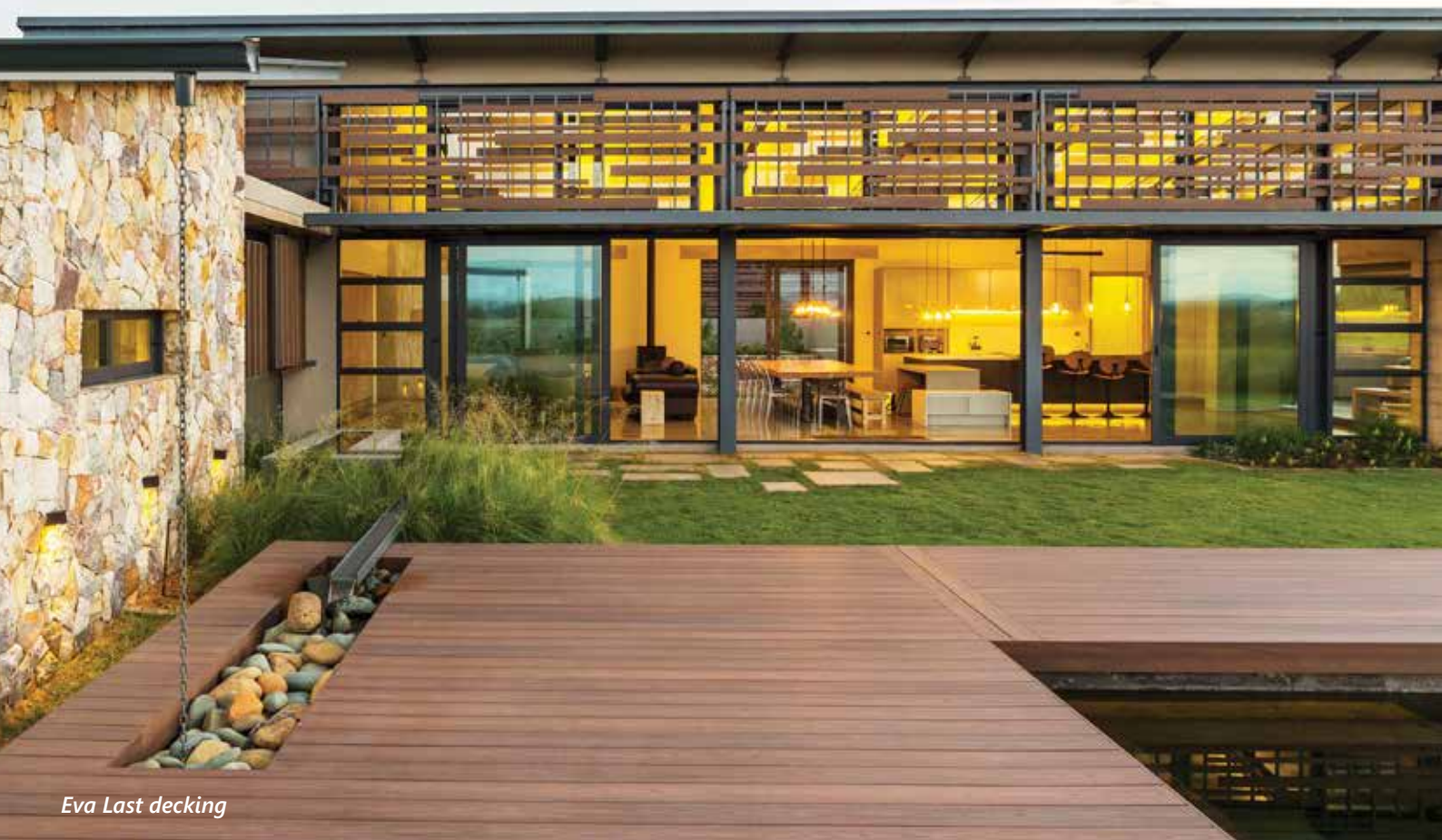
Eva Last decking