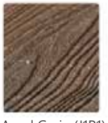
Aged Grain (J1R1)

Auckland , 64 Stoddard Road, Mt Roskill-1041. PO Box: 27-496, Mt Roskill-1440.