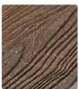
Tiger Cove (008)